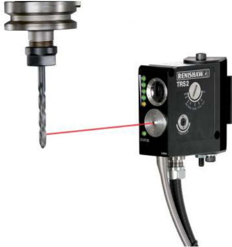
TRS2 – a non-contact broken tool detection system

Munjal Castings, machines with TRS2 installed have had their overall equipment effectiveness (OEE) increased from 50% to 76%. The target is to increase the OEE to 85%. Previously, 250 finished components were produced daily on each machine. Following installation of the TRS2 systems, production increased to 270 components per day.