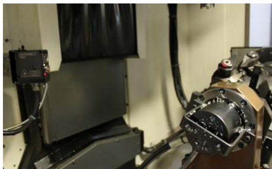
TRS2 resolved the tool breakage problem at Munjal Castings

Renishaw TRS2 systems were installed at Munjal Castings to address this challenge. The TRS2 is an award-winning non contact broken tool detection system for machining centres. It determines whether a tool is present by analysing reflective light patterns and ignores any that are created by coolant and swarf, thereby eliminating false indications of a broken tool.