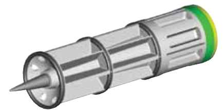
155-mm Compatible HVP