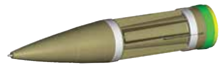
5" Compatible HVP